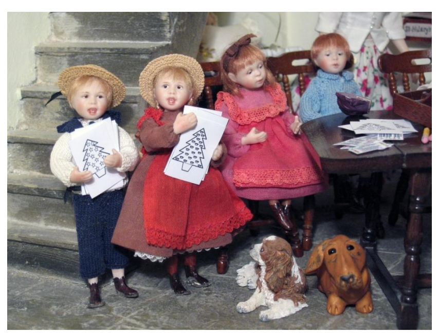
December 2009